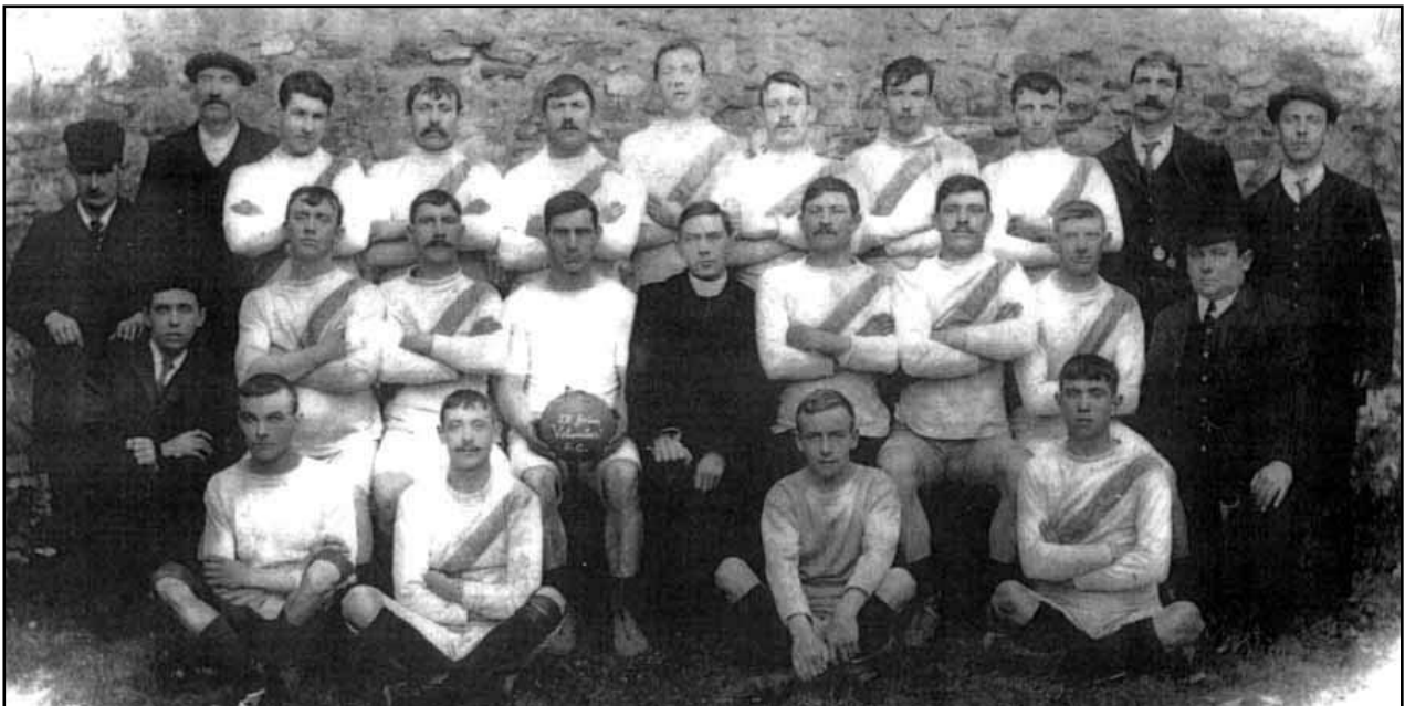
1909 Junior Football Team