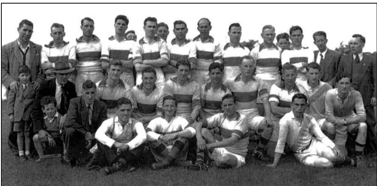
1953 County Senior Football Champions