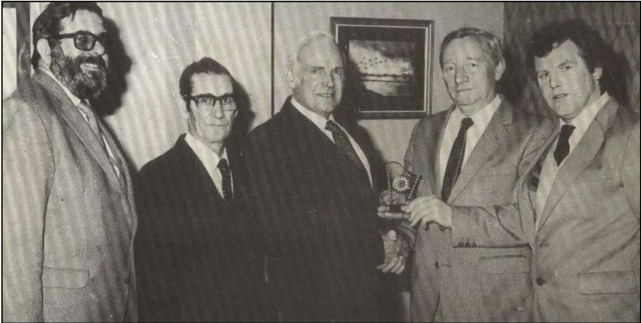
1983 Sealink Club of the Year