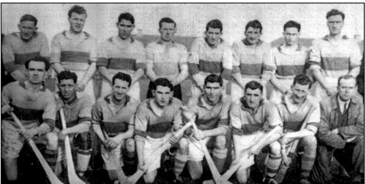
1945 Beaten County Hurling Finalists