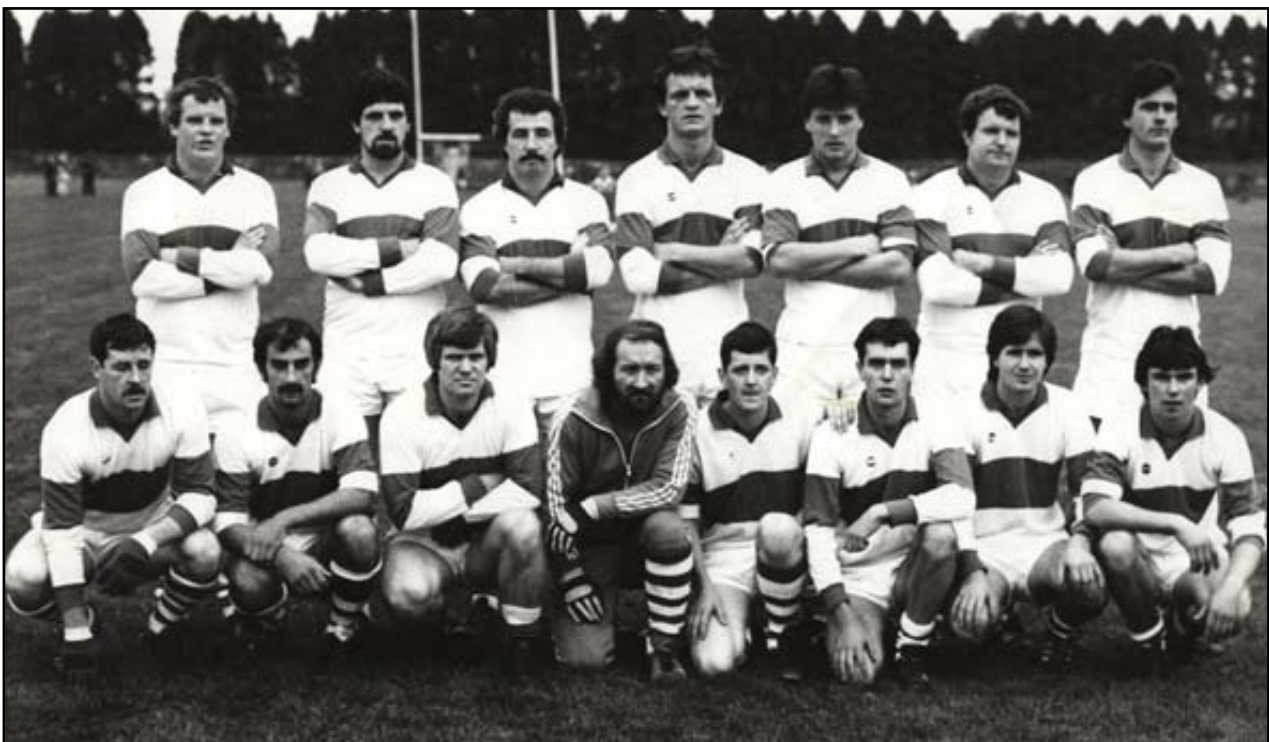
1983 Intermediate County Football Champions

2018 will see the 125 th anniversary of our Club. If we all play our part in ensuring that the actions in this Plan are completed, St. John's Volunteers will be in a position to celebrate the year in style, both on and off the field.