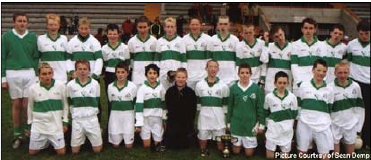
2003 Under 14 League and County Football Champions